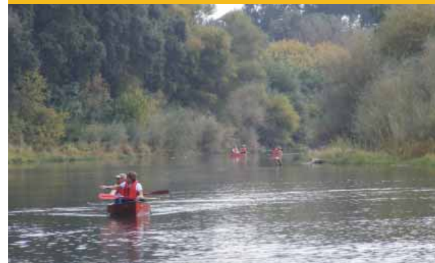
Tuolumne River