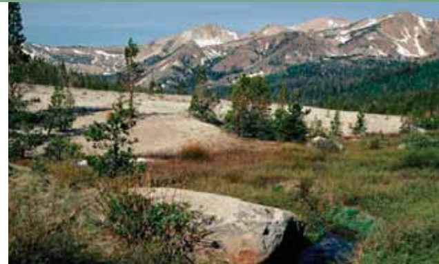
Owens River Headwaters (Inyo County & the Sierra Nevada Conservancy)

The headwaters of the Tuolumne River begin at 13,000 feet in Yosemite National Park in the Sierra Nevada Mountains. As the river travels 150 miles to the San Joaquin River, it carves out canyons that provide 27 miles of whitewater for rafters and kayakers. The state has invested millions of dollars from Propositions 40 and 50 to make the river and its surrounding area accessible and enjoyable for Californians. The river also provides irrigation water for Central Valley farms, flood control and drinking water for rural communities in the San Joaquin Valley, hydroelectricity for the San Francisco Bay Area along with boating, swimming, fishing and water skiing at Millerton Lake and Lake Don Pedro.