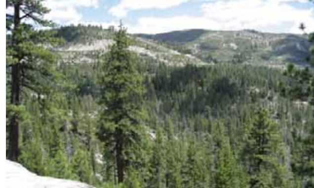
Donner Memorial State Park (Truckee)

The Turner Creek Ranch is 725 acres of working forest and ranch land nestled along the edge of the beautiful Sierra Valley in Sierra County. The Turner Family has owned and ranched there for more than 150 years. More than $4 million from Proposition 50 purchased a conservation easement, ensuring this land will remain a working ranch and continue to provide valuable wildlife habitat for more than 250 wildlife species, including the bald eagle and willow flycatcher.