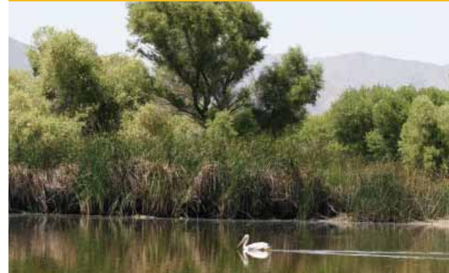
South Fork Kern River Valley (Kern County)